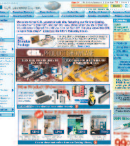
Access to All CRL Products Through CRL's Easy-to-Use A to Z Product Index

C.R. Laurence Company has a Technical Sales Department to assist with design plans and installation questions. Your job can be made easier with the help of CRL's Technical Sales Representatives who are trained in the newest Hardware Systems, and can offer you detailed diagrams and layout sheets. Ask for Extension 7770.